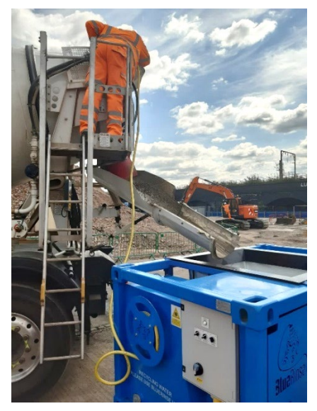
The solids will be caught in the Nappy Sack, the pH of the water will be reduced as it passes through the sack and drains into the sump where it returns to the tank, forming a closed loop.

6. Position the chute and wash down using the hose on the unit.